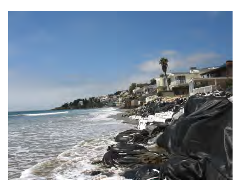
Figure 5. Under winter beach conditions, these temporary protection structures in Malibu significantly reduced lateral and vertical access.

Wave reflection off the armoring structure can also degrade the quality of a surfing area or make it unsafe for swimmers to enter the water, further diminishing recreational opportunities.<sup>36</sup>