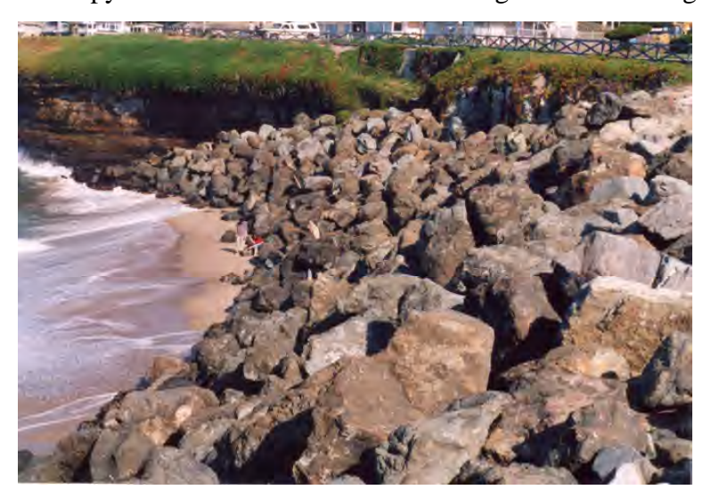
Figure 1. Revetment in the city of Santa Cruz showing placement loss eliminating nearly the entire beach.<sup>26</sup>

Shoreline armoring produces several impacts that limit sand supply and reduce the width of the beach. First, the beach area under the footprint of the actual armoring structure is lost. This is known as placement loss (see Fig. 1). For example, rock revetments can occupy over 30 feet of beach width along their entire length.<sup>25</sup>