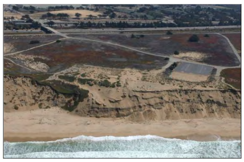
Figure 4. Once the building and revetment were removed, the beach recovered.<sup>34</sup>