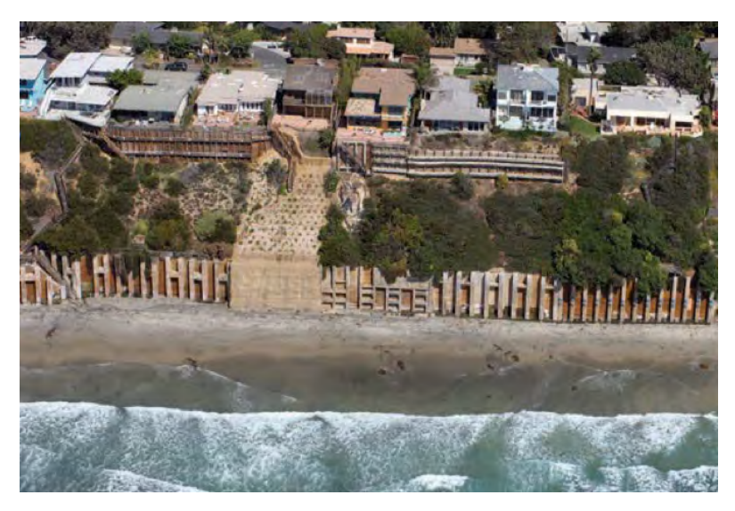
Figure 6. Armoring marring the shoreline in Encinitas, in northern San Diego County, 2010.