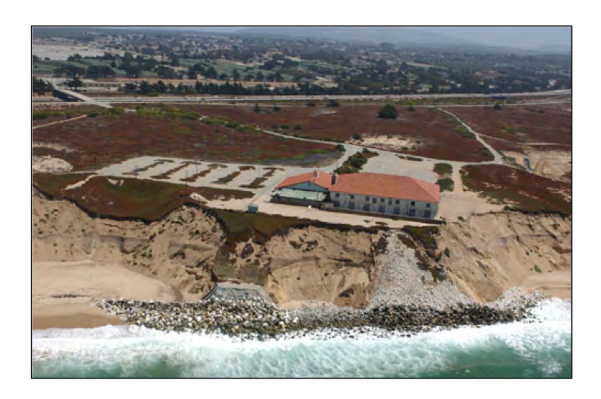
Figure 3. Revetment protecting Fort Ord showing placement loss, end effects, and impoundment loss. <sup>33</sup>