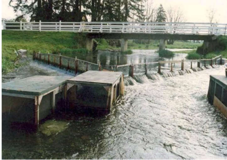
Figure 2. Example Weir