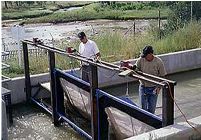
Figure 3. Example Entrainment Netting