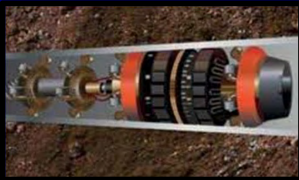
Pipeline Inspection Tools