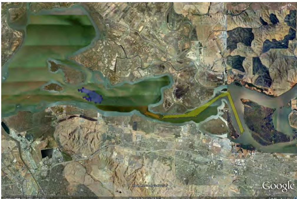
Figure 1-2. Commercial Sand Mining Leases in the West Delta Region of San Francisco Bay