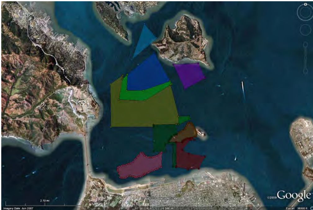
Figure 1-1. Commercial Sand Mining Leases in Central Bay Region of San Francisco Bay