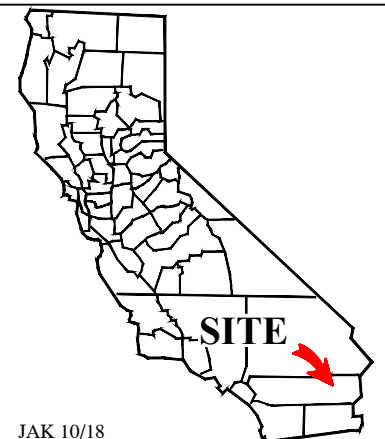
Exhibit A PRC 4910.2 SOCIETY FOR THE CONSERVATION OF BIGHORN SHEEP GENERAL LEASE - OTHER RIVERSIDE COUNTY