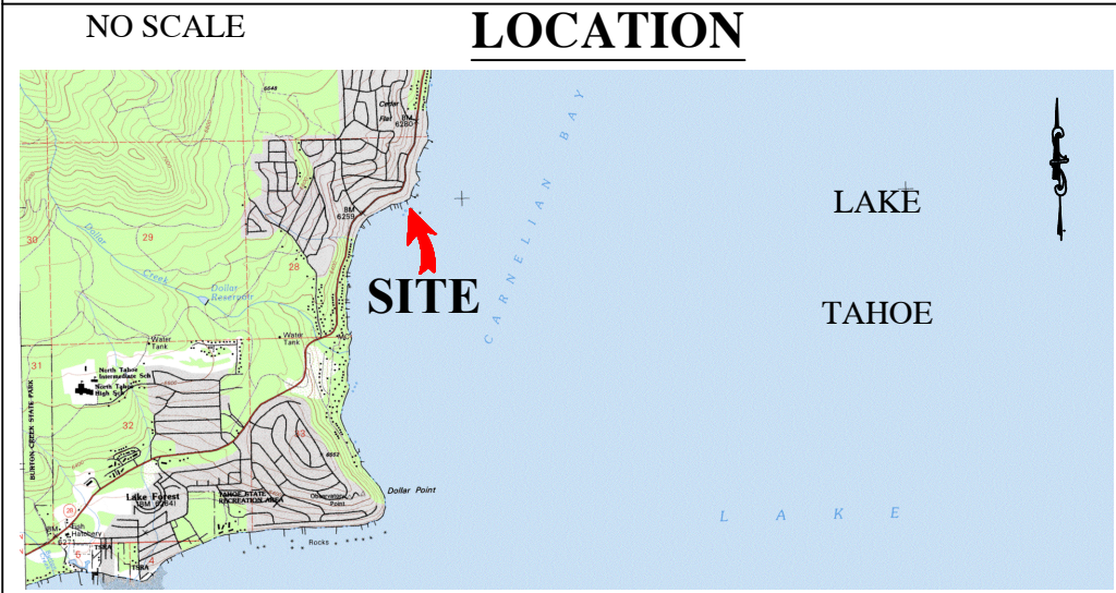
MAP SOURCE: USGS QUAD

Exhibit A PRC 5122.1 SICHEL TRUST APN 092-200-010 GENERAL LEASE - RECREATIONAL USE PLACER COUNTY