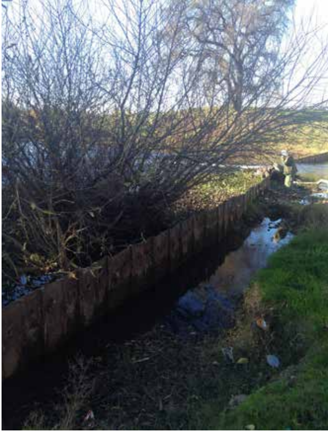
EXHIBIT D DENNETT DAM