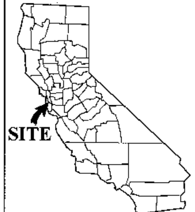
Exhibit B W 26979 CITY OF FOSTER CITY APN 097-080-030 GENERAL LEASE - DREDGING SAN MATEO COUNTY