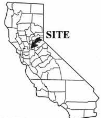
Exhibit B PRC 7014.1 WEST APN 157-0100-072 GENERAL LEASE - RECREATIONAL & PROTECTIVE STRUCTURE SACRAMENTO COUNTY