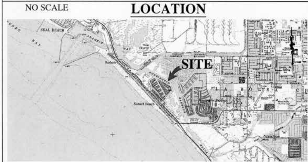
Exhibit B PRC 5245.1 SENN APN 178-713-04 GENERAL LEASE- RECREATIONAL USE ORANGE COUNTY