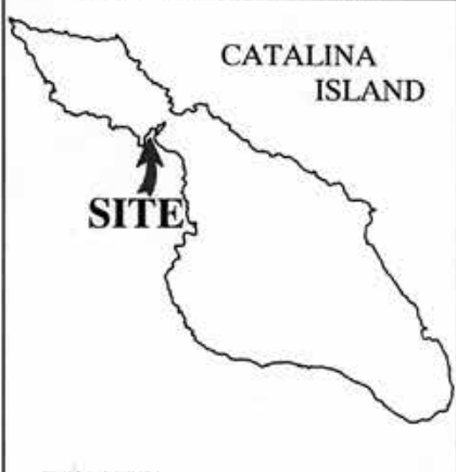
Exhibit B PRC 3639.1 SANTA CATALINA ISLAND COMPANY & SANTA CATALINA ISLAND CONSERVANCY GENERAL LEASE - COMMERCIAL USE LOS ANGELES COUNTY

This Exhibit is solely for purposes of generally defining the lease premises, is based on unverified information provided by the Lessee or other parties and is not intended to be, nor shall it be construed as, a waiver or limitation of any State interest in the subject or any other property.