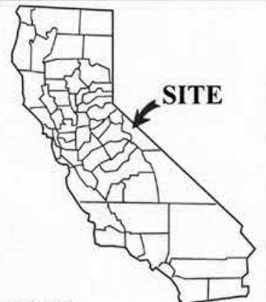
Exhibit B PRC 9085.9 GREAT BASIN UAPCD GENERAL LEASE - PUBLIC AGENCY USE INYO COUNTY

This Exhibit is solely for purposes of generally defining the lease premises, is based on unverified information provided by the Lessee or other parties and is not intended to be, nor shall it be construed as, a waiver or limitation of any State interest in the subject or any other property.