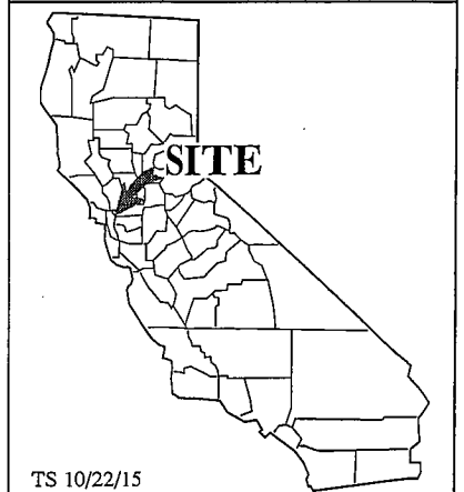
Exhibit B PRC 5782.1 WALTON APN 0062-030-040 GENERAL LEASE - RESIDENTIAL & RECREATIONAL USE SOLANO COUNTY

This Exhibit is solely for purposes of generally defining the lease premises, is based on unverified information provided by the Lessee or other parties and is not intended to be, nor shall it be construed as, a waiver or limitation of any State interest in the subject or any other property.