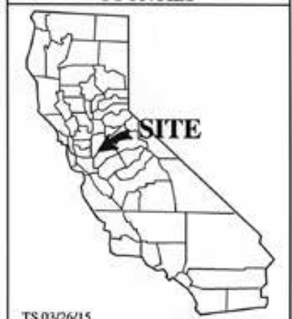
Exhibit B W 26847 MODESTO IRRIGATION DISTRICT GENERAL LEASE - PUBLIC AGENCY USE SAN JOAQUIN & STANISLAUS COUNTIES

This Exhibit is solely for purposes of generally defining the lease premises, is based on unverified information provided by the Lessee or other parties and is not intended to be, nor shall it be construed as, a waiver or limitation of any State interest in the subject or any other property