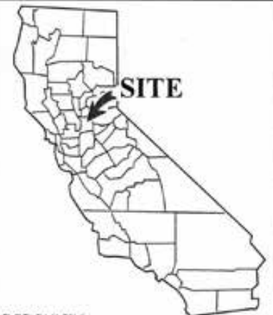
Exhibit B PRC 3673.9 SACRAMENTO MUNICIPAL UTILITY DISTRICT GENERAL LEASE - PUBLIC AGENCY USE SACRAMENTO COUNTY

This Exhibit is solely for purposes of generally defining the lease premises, is based on unverified information provided by the Lessee or other parties and is not intended to be, nor shall it be construed as, a waiver or limitation of any State interest in the subject or any other property.