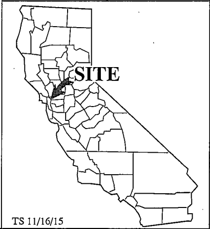
Exhibit B PRC 5794.1 FEA APN 0062-020-160 GENERAL LEASE - RECREATIONAL USE SOLANO COUNTY

This Exhibit is solely for purposes of generally defining the lease premises, is based on unverified information provided by the Lessee or other parties and is not intended to be, nor shall it be construed as, a waiver or limitation of any State interest in the subject or any other property.