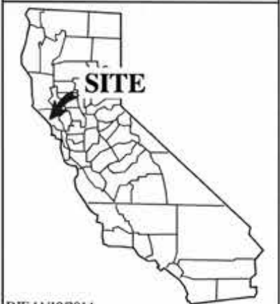
Exhibit B W25885 SONOMA COUNTY APN 110-220-003 & 110-220-015 GENERAL LEASE - PUBLIC AGENCY USE SONOMA COUNTY