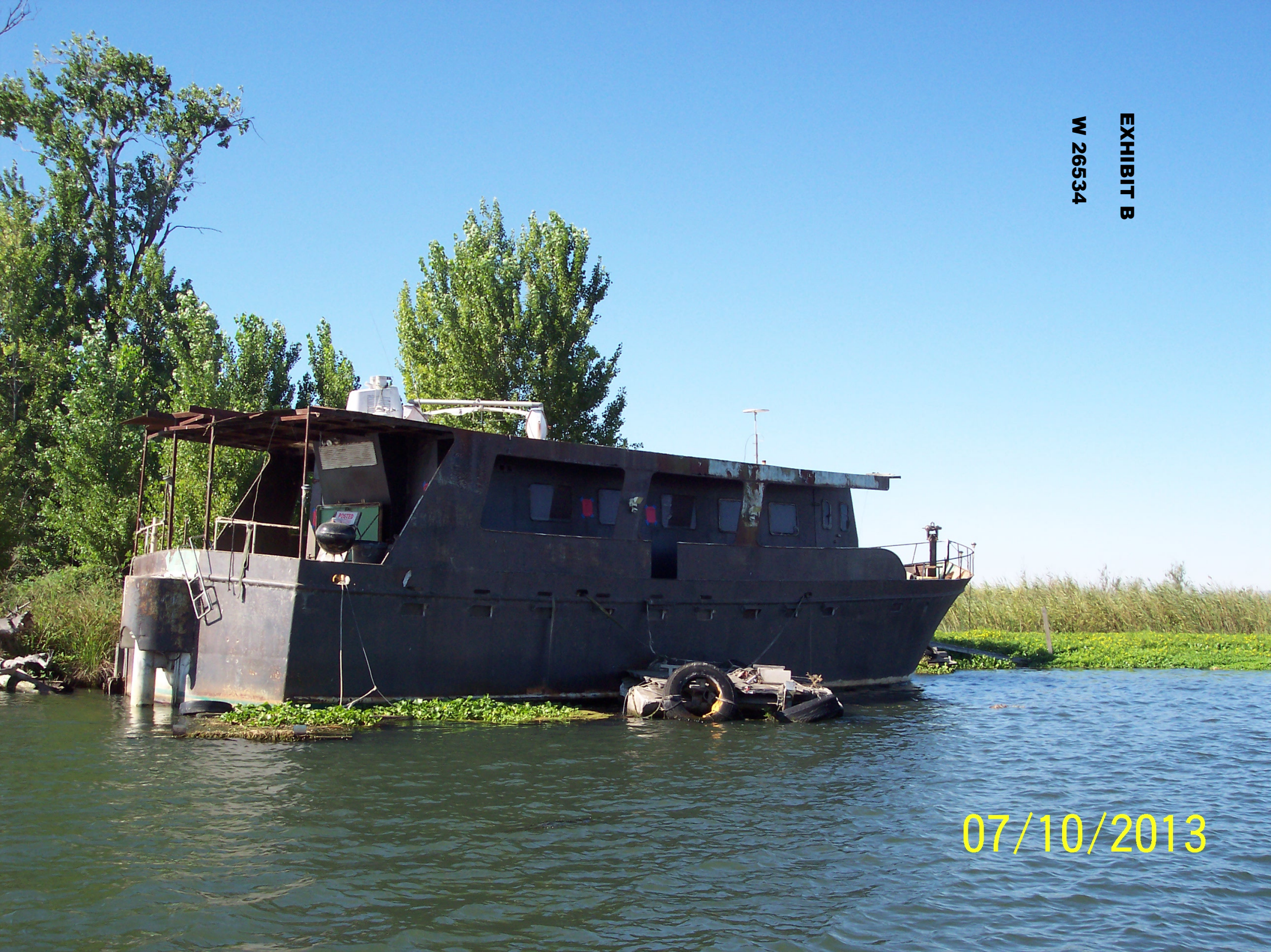
EXHIBIT B W 26534