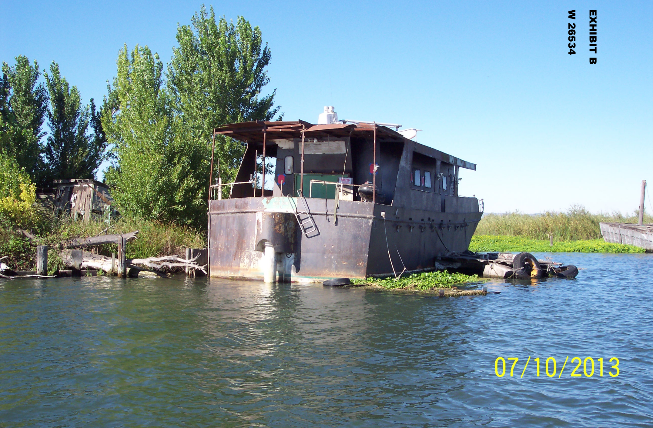
EXHIBIT B W 26534