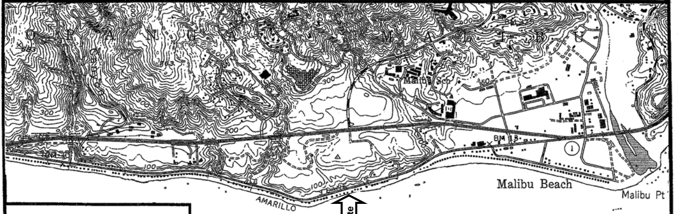
Exhibit A W24665 32506 Malibu Road