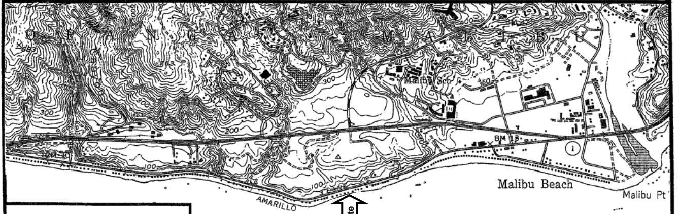
Exhibit A W24665 25228 Malibu Road