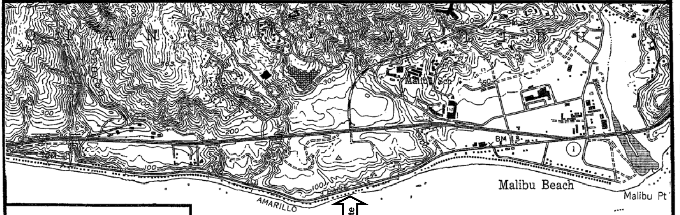
Exhibit A W24665 24008 Malibu Road