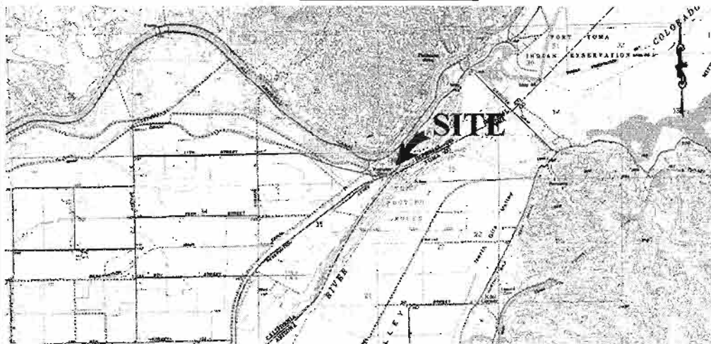
MAP SOURCE: USGS QUAD