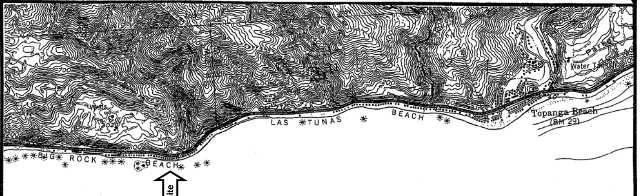
Exhibit A W24665 20016 Pacific Coast Highway