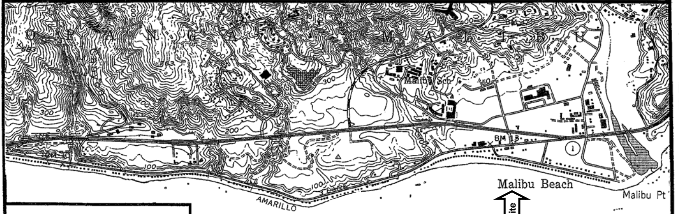
Exhibit A W24665 23674 Malibu Colony Drive