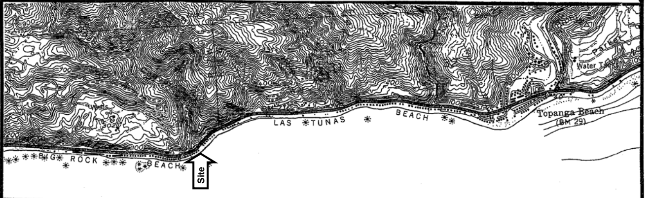
Exhibit A W24665 19906 Pacific Coast Highway