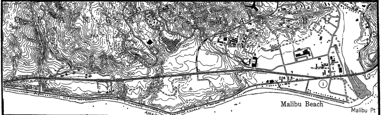
Exhibit A W24665 Tract 13157 Lots 14,15,16, & 17