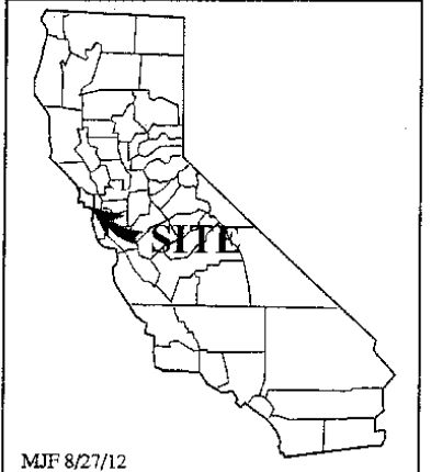
Exhibit B W 26613 PORT OF SAN FRANCISCO - AMERICA'S CUP DREDGING DREDGING LEASE SAN FRANCISCO COUNTY

This Exhibit is solely for purposes of generally defining the lease premises, is based on unverified information provided by the Lessee or other parties and is not intended to be, nor shall it be construed as, a waiver or limitation of any State interest in the subject or any other property.