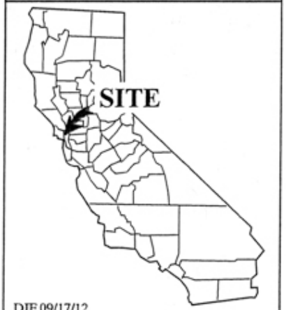
Exhibit B W 26571 PORTO BELLO ASSOCIATION GENERAL LEASE - DREDGING MARIN COUNTY

This Exhibit is solely for purposes of generally defining the lease premises, is based on unverified information provided by the Lessee or other parties and is not intended to be, nor shall it be construed as, a waiver or limitation of any State interest in the subject or any other property.