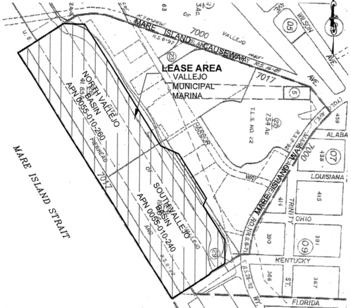
VALLEJO MUNICIPAL MARINA, CITY OF VALLEJO