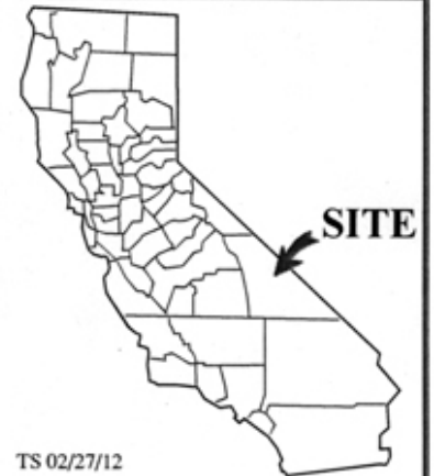
Exhibit A PRC 3463.2 SOUTHERN CALIFORNIA EDISON GENERAL LEASE- RIGHT-OF-WAY USE INYO COUNTY

This Exhibit is solely for purposes of generally defining the lease premises, is based on unverified information provided by the Lessee or other parties and is not intended to be, nor shall it be construed as, a waiver or limitation of any State interest in the subject or any other property.