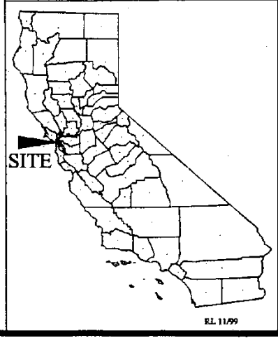
Exhibit A PRC 7160 Lowrie Yacht Harbor Dredging City of San Rafael MARIN COUNTY

This Exhibit is solely for purposes of generally defining the lease premises, and is not intended to be, nor shall it be construed as, a waiver of limitation of any state interest in the subject or any other property.