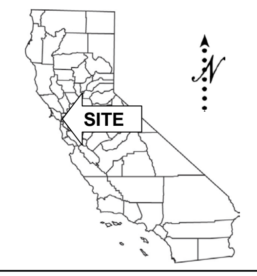
Exhibit A W 26434 EXXON MOBIL OIL CORP. COUNTY OF SAN FRANCISCO

This exhibit is solely for purposes of generally defining the lease premises, is based on unverified information provided by the Lessee or other parties, and is not intended to be, nor shall it be construed as a waiver or limitation of any State interest in the subject or any other property.