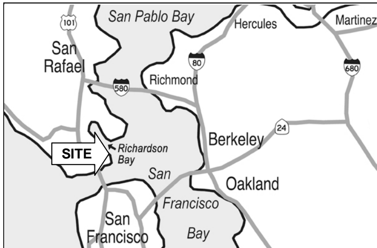
Exhibit A W 26406 PELICAN HARBOUR MARIN COUNTY