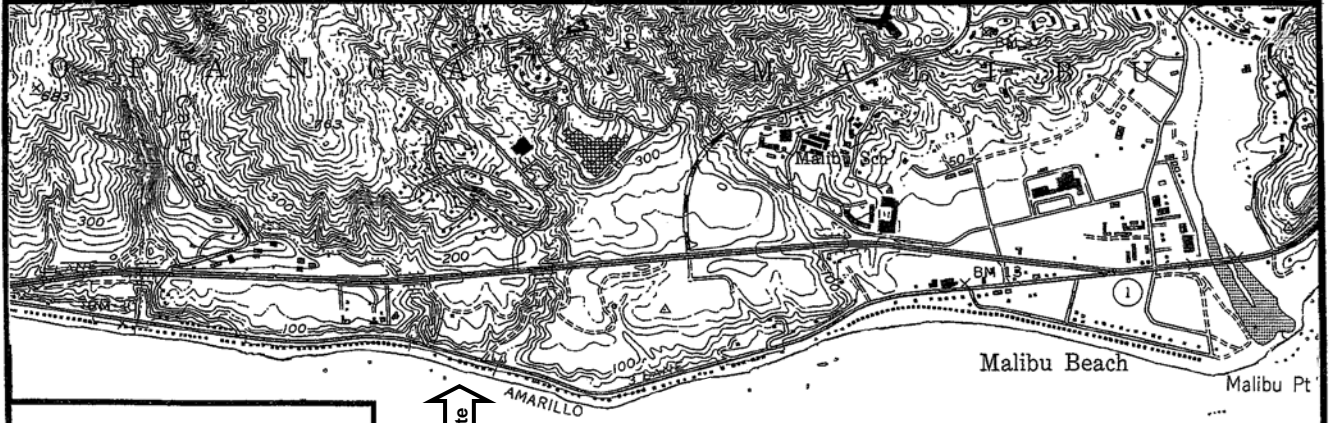
Exhibit A W24665 24572 Malibu Road