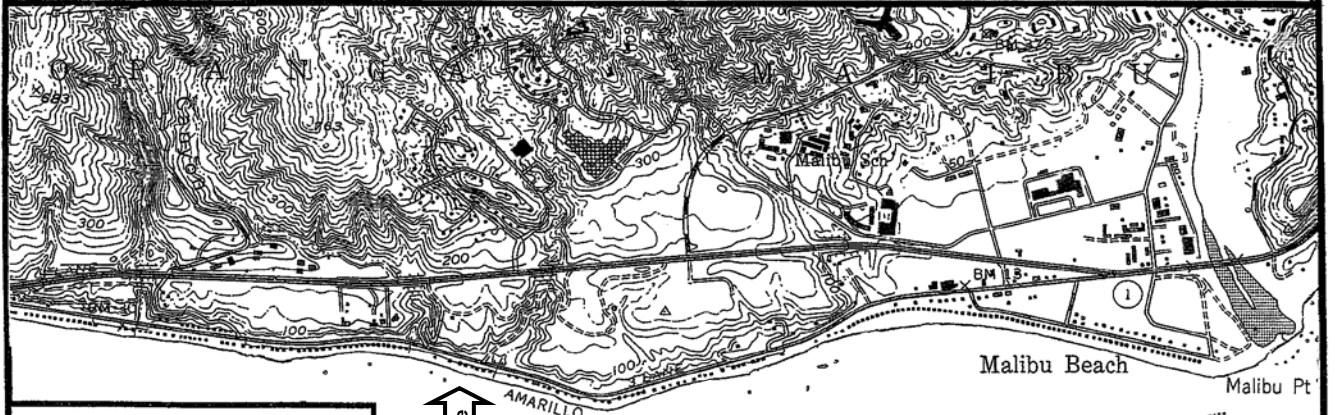
Exhibit A W24665 24560 Malibu Road