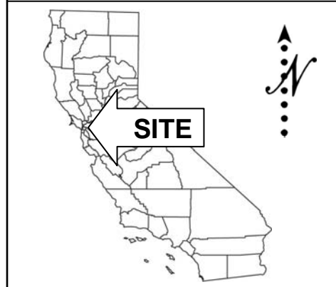
EXHIBIT A APPLICATION FOR DREDGING CITY OF VALLEJO PRC 7019.9 MARE ISLAND STRAIT SOLANO COUNTY

This exhibit is solely for purposes of generally defining the lease premises, is based on unverified information provided by the Lessee or other parties, and is not intended to be, nor shall it be construed as a waiver or limitation of any State interest in the subject or any other property.