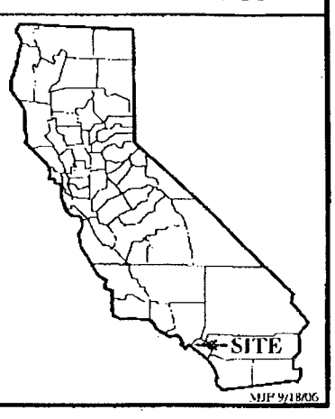
Exhibit A W 26078 ORANGE COUNTY FLOOD CONTROL DISTRICT PUBLIC AGENCY LEASE RIGHT-OF-WAY USE ORANGE COUNTY

This Exhibit is solely for purposes of generally defining the lease premises, is based on unverified information provided by the Lessee or other parties and is not intended to be, nor shall it be construed as, a waiver or limitation of any State interest in the subject or any other property.