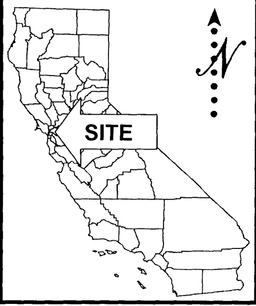
Exhibit A WP 7540 ALAMEDA COUNTY

This exhibit is solely for purposes of generally defining the lease premises, is based on unverified information provided by the Lessee or other parties, and is not intended to be, nor shall it be construed as a waiver or limitation of any State interest in the subject or any other property.