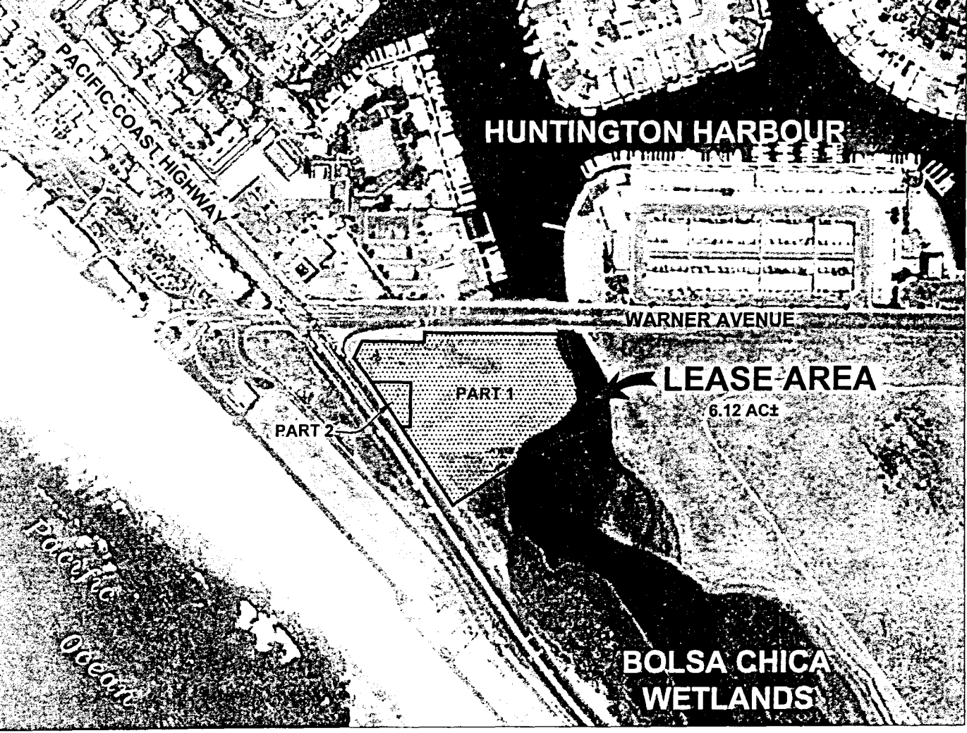
BOLSA CHICA CONSERVANCY 3842 WARNER AVE., HUNTINGTON BEACH