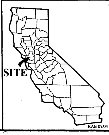
Exhibit A W 25949 RIO DELTA RESOURCES CONTRA COSTA COUNTY

This Exhibit is solely for purposes of generally defining the lease premises, is based on unverified information provided by the Lessee or other parties and is not intended to be, nor shall it be construed as, a waiver or limitation of any State interest in the subject or any other property.