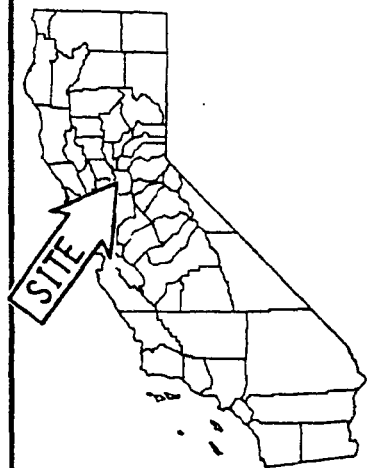
Exhibit A W 25940