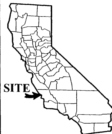
Exhibit A PRC5589.9 San Luis Obispo County Parks GENERAL LEASE SAN LUIS OBISPO CO.

This Exhibit is solely for purposes of generally defining the lease premises, is based on unverified information provided by the Lessee or other parties and is not intended to be, nor shall it be construed as, a waiver or limitation of any State interest in the subject or any other property.