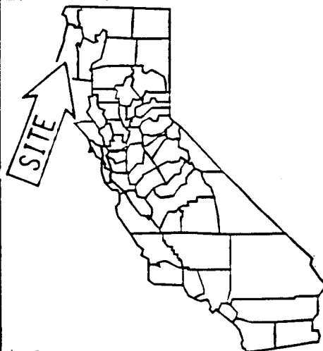
EXHIBIT A PRC 2760.1 General Lease – R/W Use EEL RIVER Humboldt County

This exhibit is solely for the purposes of generally defining the lease premises, is based on unverified information provided by lessee or other parties, and is not intended to be, nor shall it be construed as a waiver or limitation of any state interest in the subject or any other property.