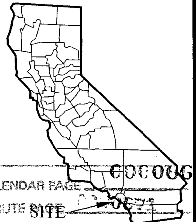
Exhibit A WP3573 178-315-43 Huntington Harbour ORANGE COUNTY

This Exhibit is solely for purposes of generally defining the lease premises, is based on unverified information provided by the lessee or other parties and is not intended to be, nor shall it be construed as, a waiver or limitation of any state interest in the subject or any other property.