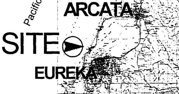
Exhibit A PRC 3186 Louisiana - Pacific Corp. Outfall Pipeline APN 401-111-06 HUMBOLDT COUNTY