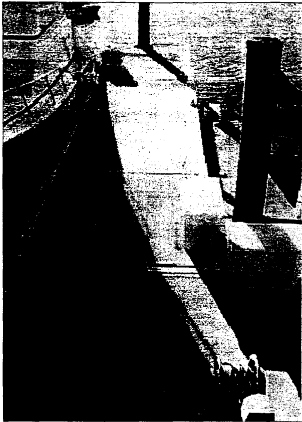
Southerly Portion of "L"-shaped Dock