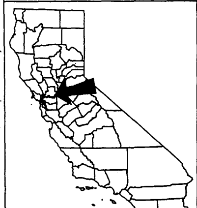
Exhibit A W 25733 GL Public Agency City of Modesto Stanislaus County