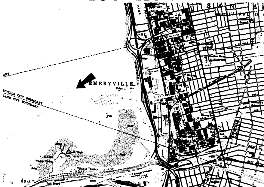
Exhibit A W 7479

Maintenance Dredging City of Emeryville Alameda County