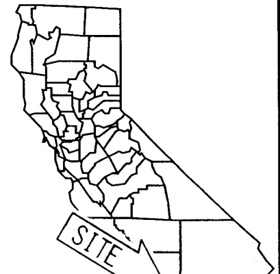
EXHIBIT "A" LOCATION MAP - WP5742 APN 178-652-37 16722 CORAL CAY LANE HUNTINGTON BEACH ORANGE COUNTY, CA.