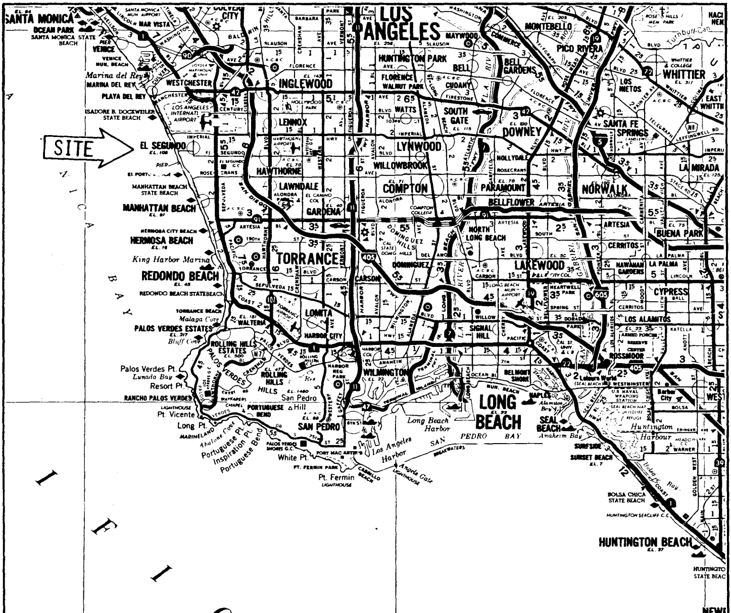
EXHIBIT "B" PRC 5628